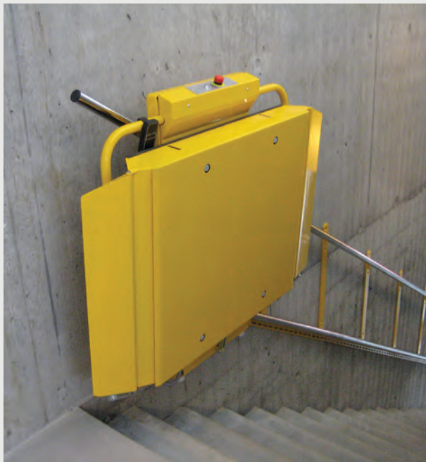
Platform can be coated in any RAL colour