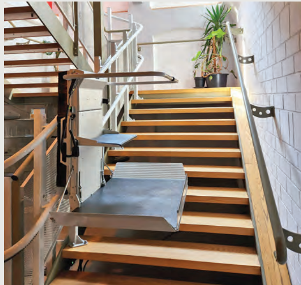
Optional fold-down seat allows people with restricted mobility to use the platform too, not just wheelchair users