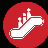
Escalators & moving walkways