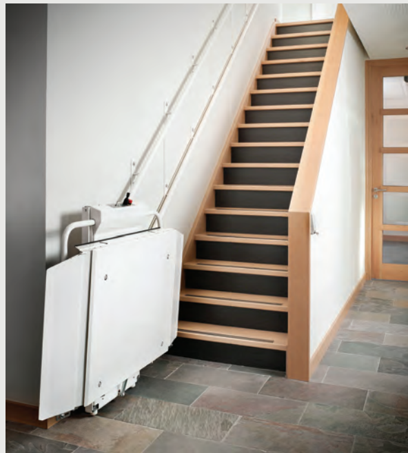
Folds away to allow people to safely access the stairs