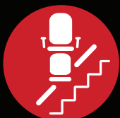
Stairlifts & homelifts