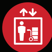
Goods & service lifts