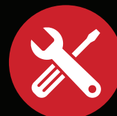
Refurbishment, service & repair