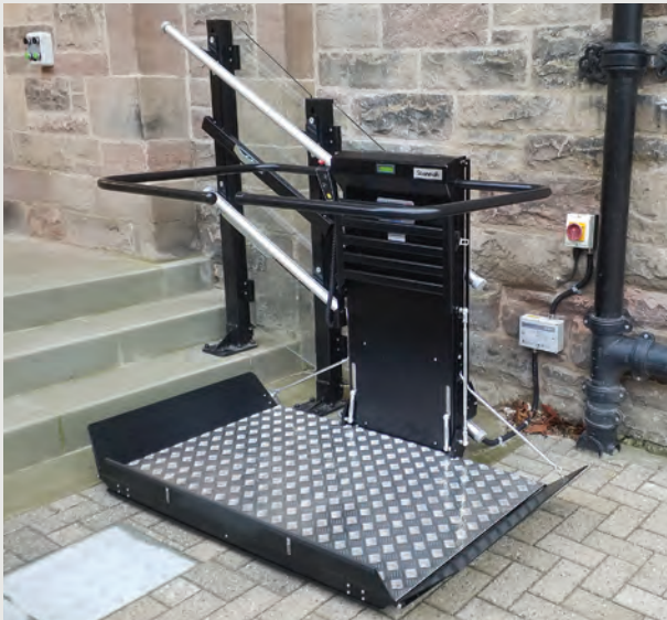
Glass or stainless steel backing panels available depending on site and mounting configuration. Designed to reduce potential trapping hazards