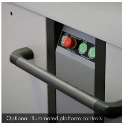
Optional illuminated platform controls