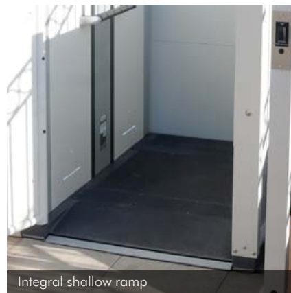
Integral shallow ramp